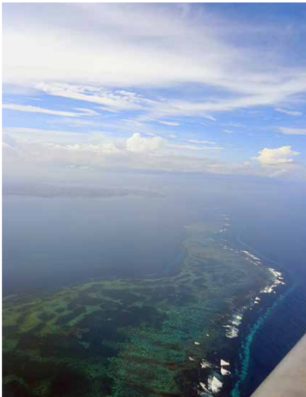
Coming into Port Moresby

I do have to mention that for those who have not traveled to PNG for a while that the Jacksons International Airport has undergone a complete transformation and is a pleasant space to be waiting for a plane, and the domestic terminal is also getting a make-over.