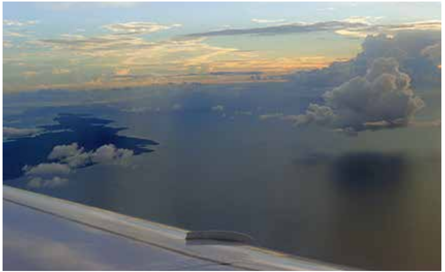
Leaving Rabaul as the sun sets

The first thing you see when you alight from the boat and walk up the beach is the welcome to Lissenung Island sign on the beach hut/sitting/ al fresco dining area.