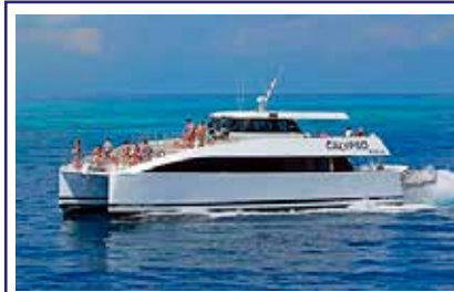
Calypso - Port Douglas Club day dive trip Contact: dive-coordinator@nautilus-scuba.net

Social get together at the Iyara Thai Restaurant..... see emails for details.