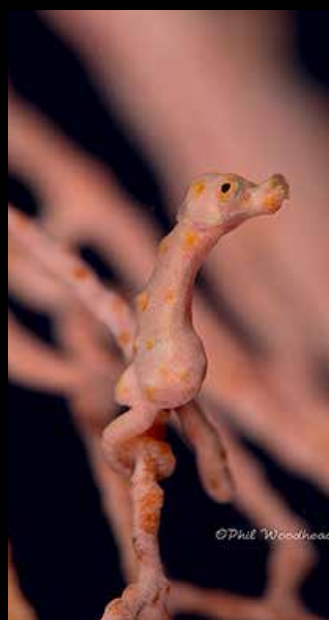
Denise Pygmy Seahorse