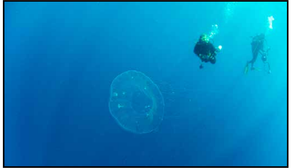
Things that go bump in the blue