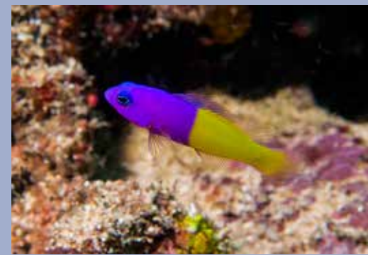
Royal Dottyback - Pseudochromis paccagnellae