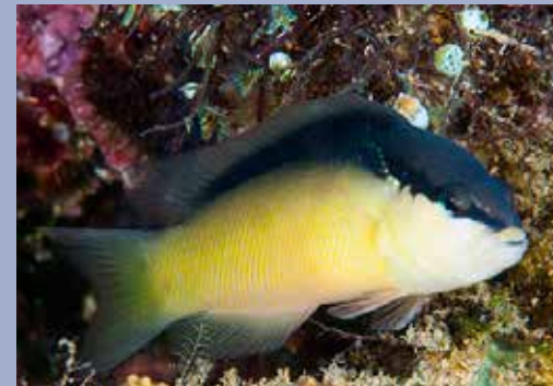
Blackstripe Dottyback - Pseudochromis perspicillatus