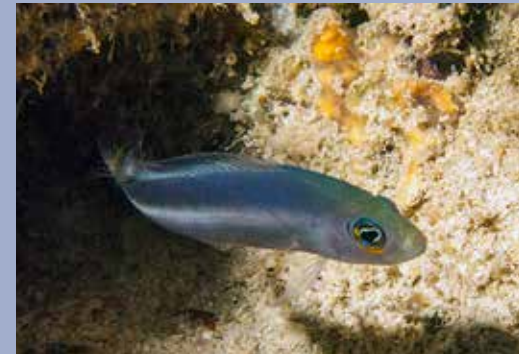
Two-lined Dottyback - Pseudochromis bitaeniatus