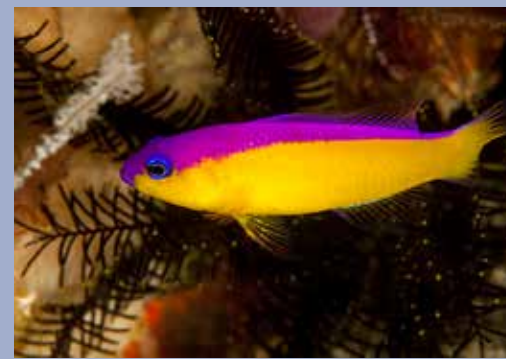
Purpletop Dottyback - Pseudochromis diadema

Most Dottybacks despite their small size and delightful colouring are pugnacious characters and will readily defend their rock cave or other dwelling against all comers. In fact many hobbyists with home aquariums have found this out when adding a Dottyback to an established tank without doing any research.