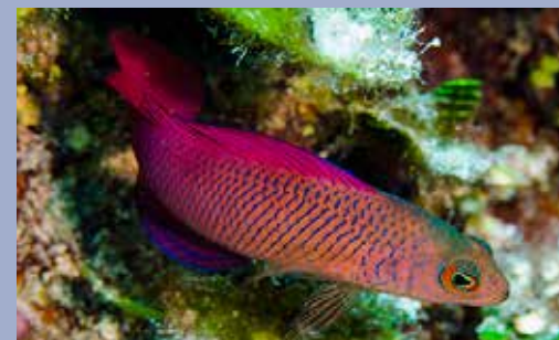
Oblique-lined Dottyback - Cypho purpurascens