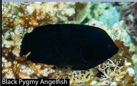
Black Pygmy Angelfish

The exception to the rule, the Midnight Dottyback - Pseudochromis paranox lives in elephant trunk sponge and mimics the Black Pygmy Angelfish - Centropyge nox .