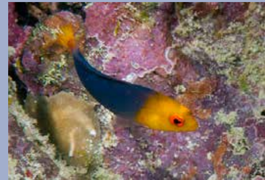
Yellowtail Dottyback - Pseudochromis flammicauda

Capturing images of Dottybacks relies on their pugnacious nature. If you study their cave dwelling and wait quietly they will eventually come and face off with you, a perfect time to press the shutter.