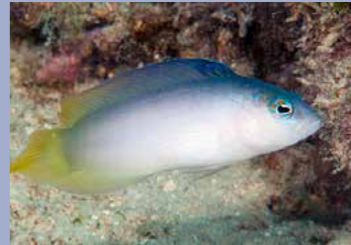
Sailfin Dottyback - Ogibyina velifera