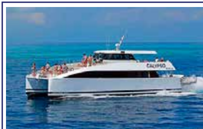
Calypso - Port Douglas Club day dive trip

We have reserved 12 spots on Calypso on Sunday 14th February to dive the Opal Reefs. Boarding 8:20am at Port Douglas Marina. To make your booking, contact Calypso on 4099 6999. Remember to tell them you are in Nautilus.