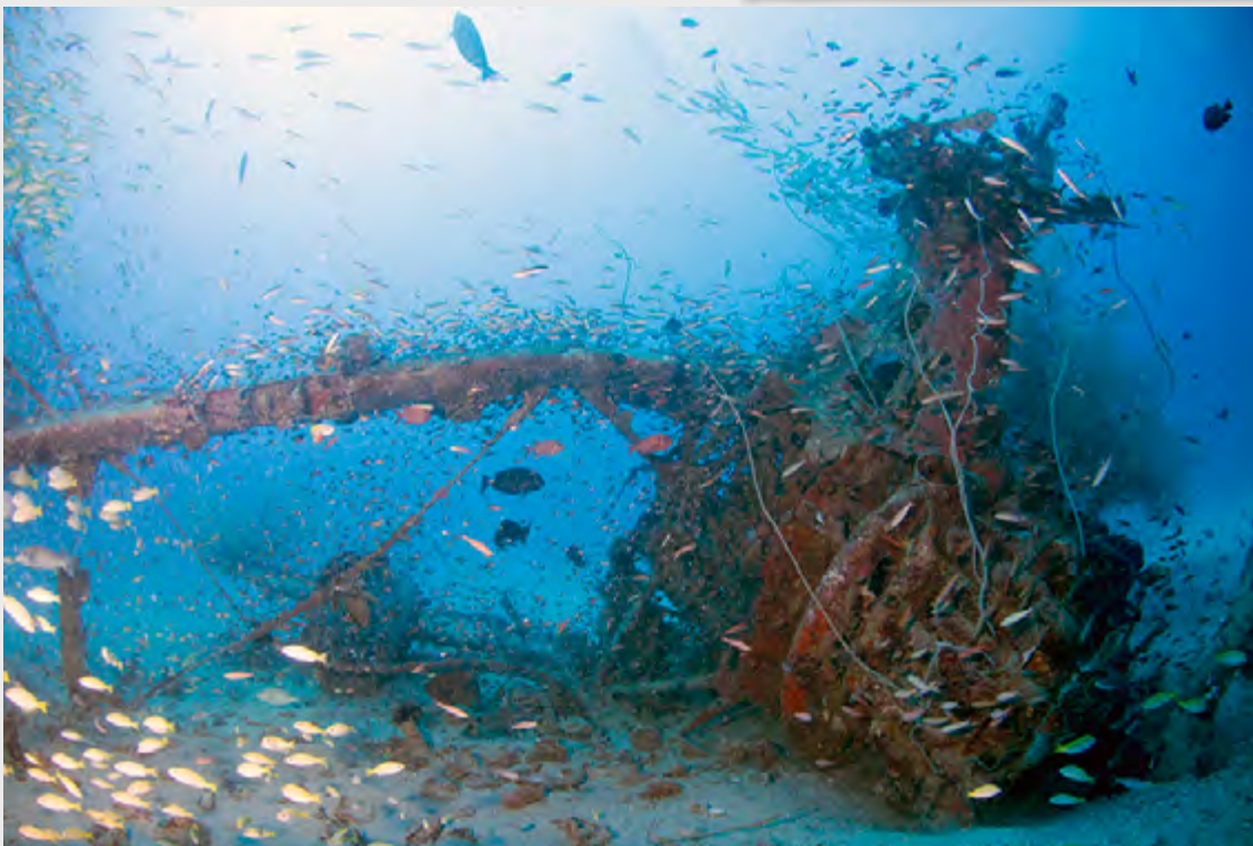
Deep Pete, an upside down bi-plane wreck