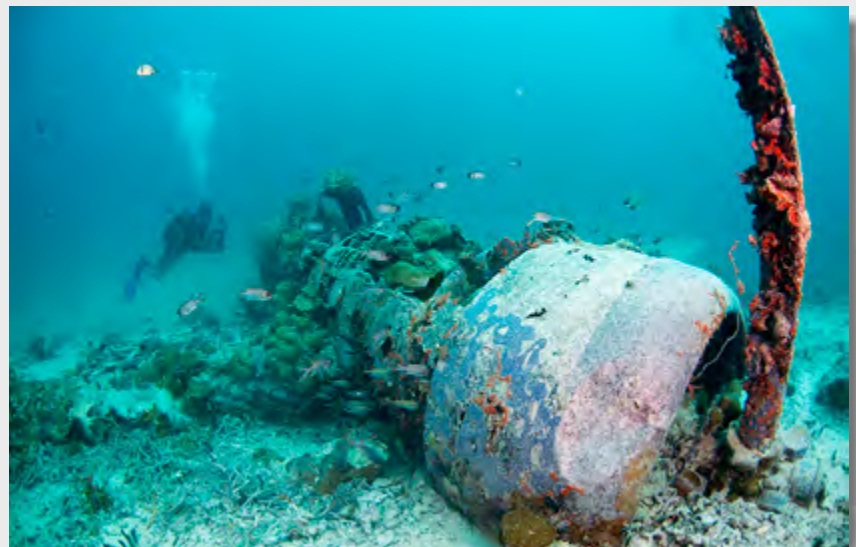
Torpedo plane wreck