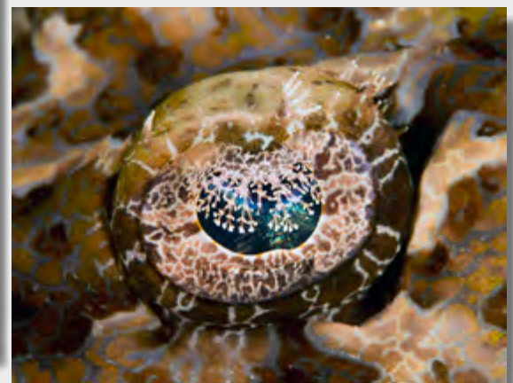
Crocodile fish eye