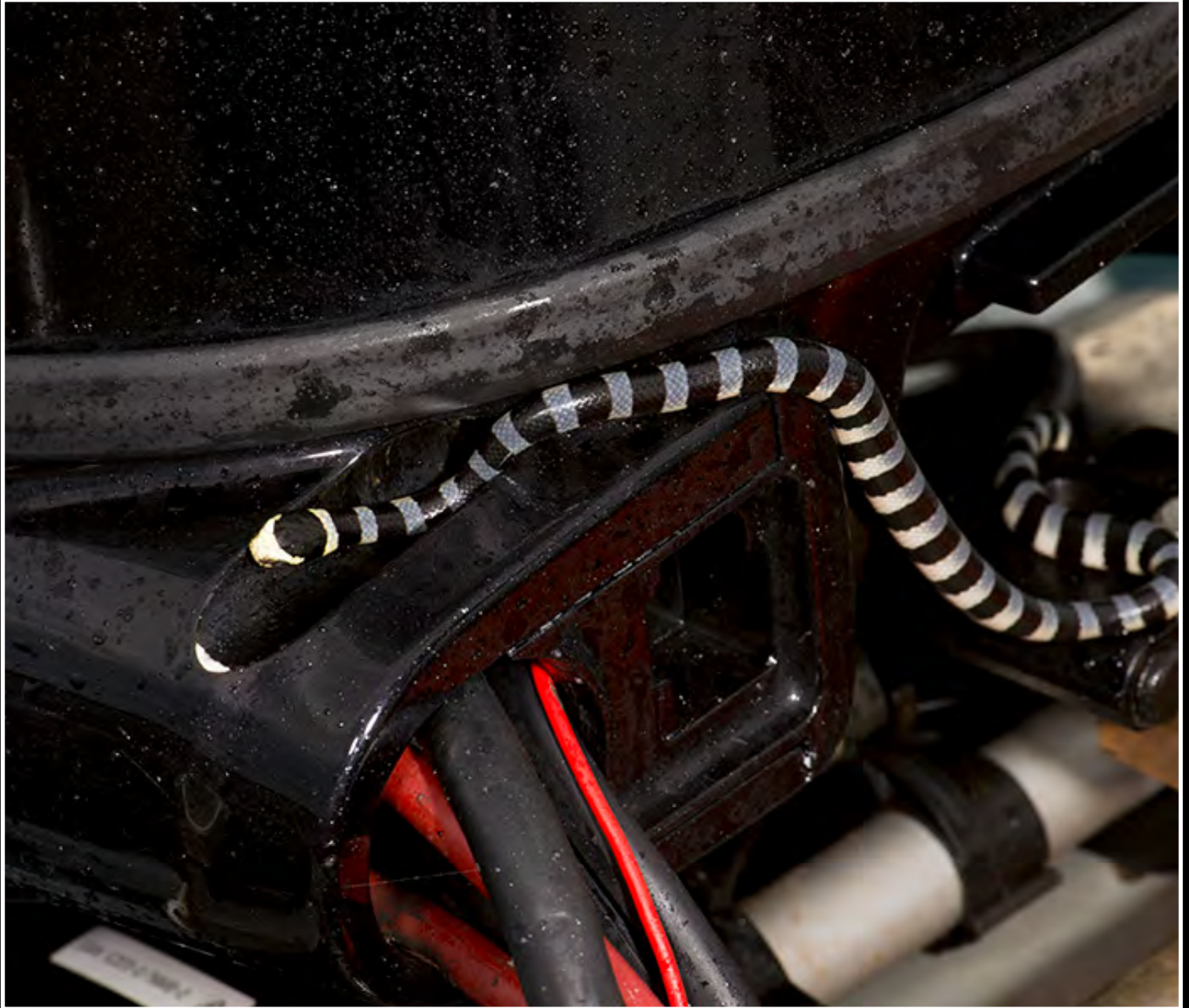
Yellow-lipped Sea Krait using the heat from the outboard to warm up.