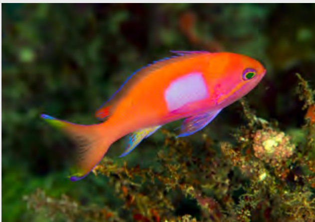
Square spot Anthias