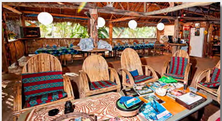
Dining room, lounge, bar