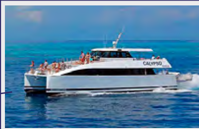
Calypso - Port Douglas Club day dive trip Contact: dive-coordinator@nautilus-scuba.net