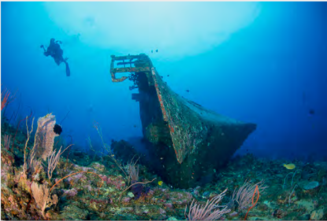
Der Yang wreck