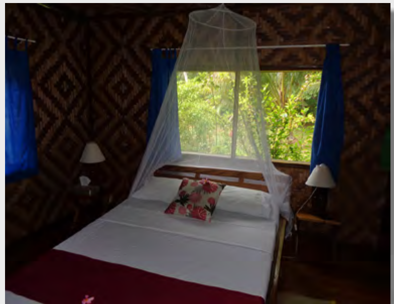
Power nap palace

The position of Island offers a range of diving from walls, wrecks and muck.